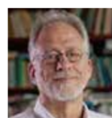
Michael Tomasello MPI / Duke U

No registration / No entrance fee required